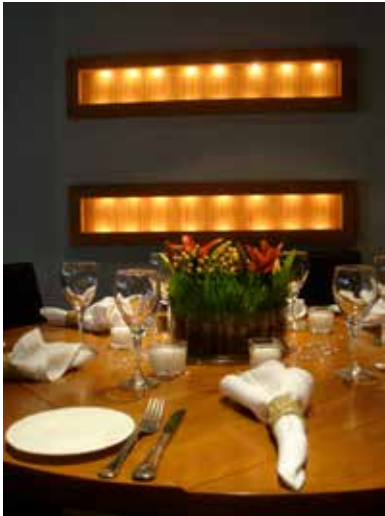
City Cafe Loft. (Table top suggestion)