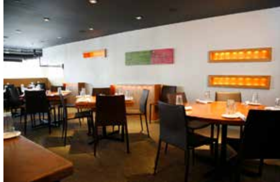
City Cafe Loft