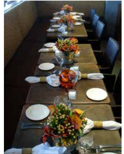
City Cafe Loft. (Table top suggestion)